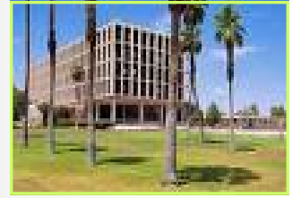
PHOENIX INDIAN MEDICAL CENTER

The Building Trades has been asked to provide volunteers for a project at the Phoenix Indian Medical Center. Volunteers will be needed to paint the medical center's hallways. The nurses here at the Phoenix Indian Medical Center are the only nurses in the valley covered by a collective bargaining agreement. Let's show our support for the unionized nurses and patients of P.I.M.C!