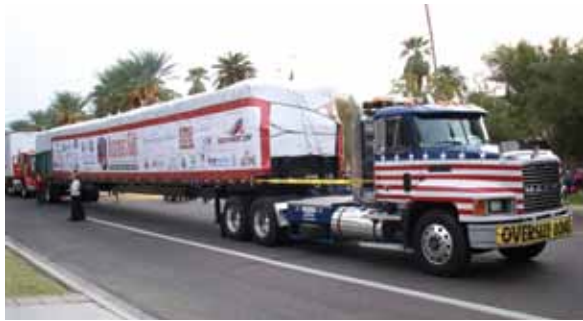
Transporting the National Christmas Tree from Arizona to Washington DC