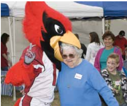
Big Red adds to the fun.

Recognition also goes out to attendees who gave blood to United Blood Services at the picnic, once again showing the giving spirit of our membership.