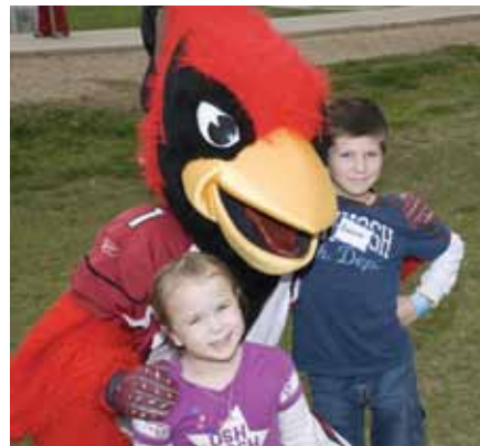
Fun for everyone!