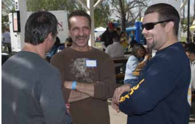
Good times and camaraderie