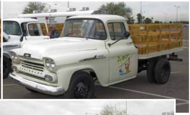
Blast from the past