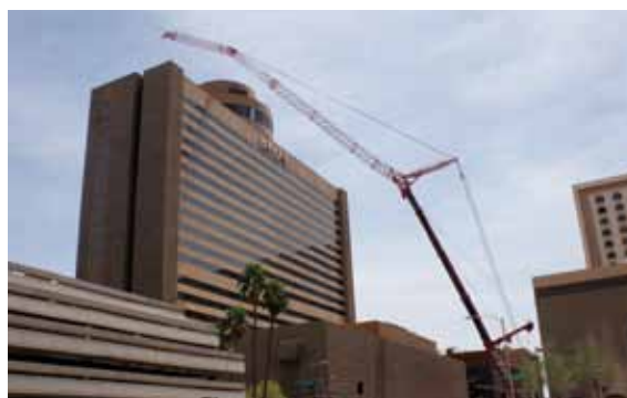
SWIR's largest crane on the job at the Hyatt in downtown Phoenix