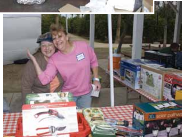
Volunteers make it all happen!