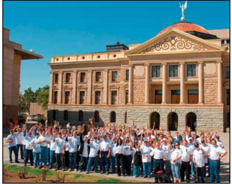
Members of Local 469 at the Arizona Capitol during the 2nd Lunch on the Capitol Lawn.

Thanks again to all the PAC volunteers for making it possible to have such a successful event! We are looking forward to making next year an even larger success!