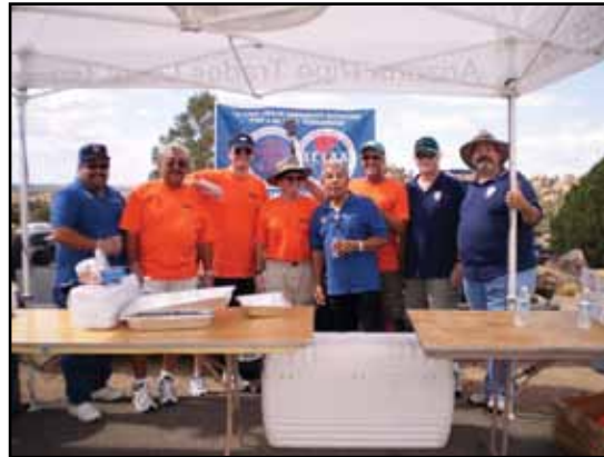
469 volunteers before cooking lunch at the annual Yavapai County Democratic Picnic.