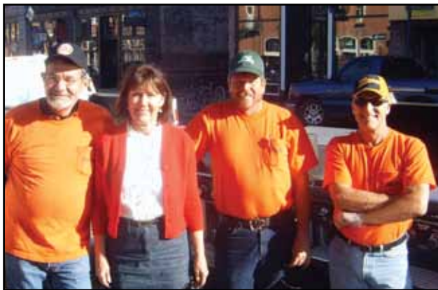
Congresswoman Ann Kirkpatrick with 469 PAC members during her signature-collection drive in Flagstaff.