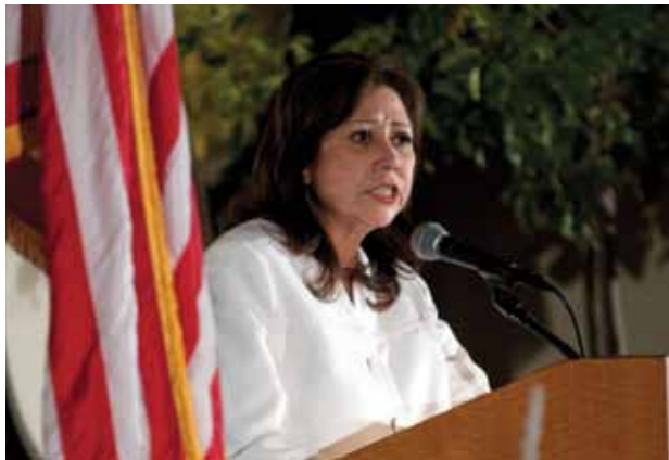
Secretary of Labor Hilda Solis speaks about issues facing labor around the county and in Arizona during the 2011 Heritage Dinner.

The U. S. secretary of labor wields substantial power when it comes to unions, government contracts and labor law. Almost immediately after Hilda Solis was appointed secretary of labor, the Arizona Pipe Trades 469 saw a sharp increase in activity at the Department of Labor. Soon after taking office in February 2009, Solis reallocated DOL funds to increased Davis-Bacon compliance, investigation and enforcement. This action has directly affected the Arizona Pipe Trades 469; the Davis-Bacon Act requires projects that receive government