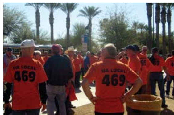
More than 70 members arrived via buses from Phoenix and Tucson, while other members grilled hundreds of hamburgers and hotdogs for the droves of BBQ attendees.