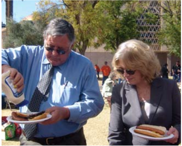
The casual picnic atmosphere gave members the opportunity – in a sea of orange! – to mingle with each other, as well as lawmakers and appointed officials from state government. A great time was had by all!