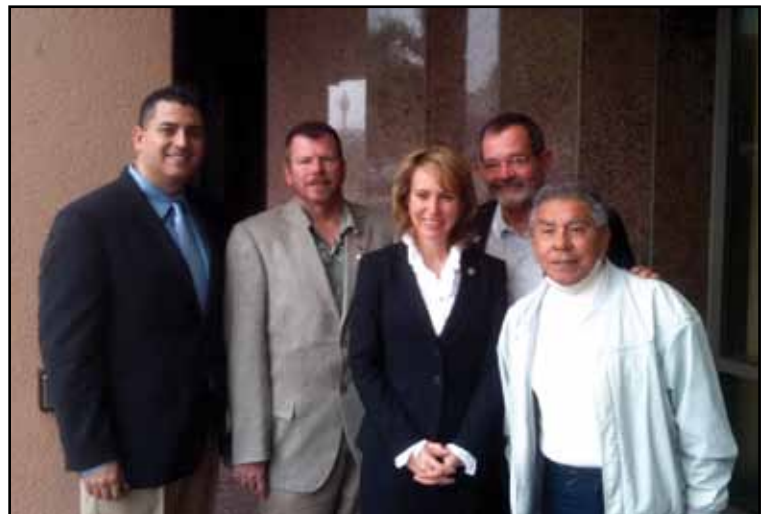
The 469 delegation after a successful meeting with Rep. Giffords.

The trip was a success and not only were the members of Congress able to update 469 on their efforts to address Arizona's ailing economy, but we were able to educate the members of Congress on issues important to Local 469.