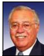
Ed Pastor - Congressional District 4

“To get Arizonans back to work in good-paying jobs, we must diversify our economy by making Arizona a growth area for tomorrow’s green-energy industries - like solar and wind power - and the technologies and jobs that accompany them.”