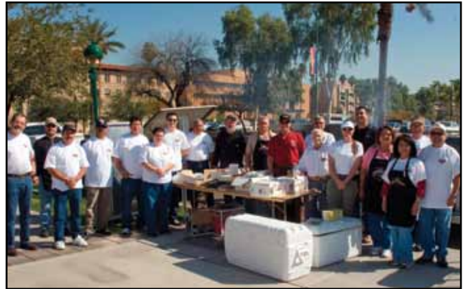
Volunteers gather for a photo before the 400+ guests arrived for the second Lunch on the Capitol Lawn.