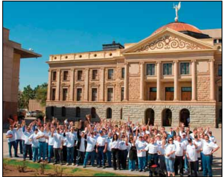
Members of Local 469 at the Arizona Capitol during the 2nd Lunch on the Capitol Lawn.

Thanks again to all the PAC volunteers for making it possible to have such a successful event! We are looking forward to making next year an even larger success!