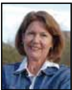
Ann Kirkpatrick - Congressional District 1

“I will work to make sure the Arizona Department of Education serves as a resource for all local school districts by providing an information clearing house for the efficient procurement of high quality building projects.”