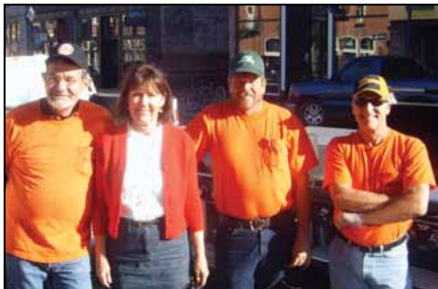
Congresswoman Ann Kirkpatrick with 469 PAC members during her signature-collection drive in Flagstaff.