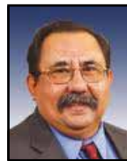
Raul Grijalva - Congressional District 7

“The most important issue we face as a state and as a nation is strengthening our economy and creating jobs... I am committed to getting our economy moving again...”