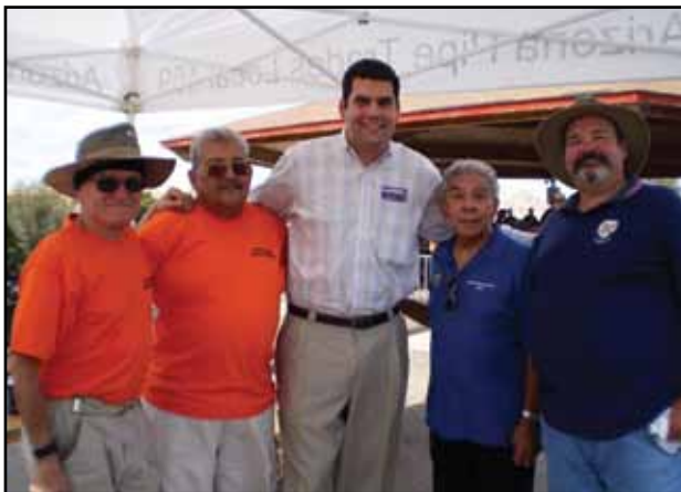
PAC 469 Volunteers with U.S. Senate candidate Rodney Glassman at the annual Yavapai County Democratic Picnic where the PAC grilled lunch for the more than 150 attendees.