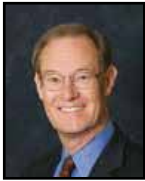
Terry Goddard - Governor

The statewide and Federal elections are heating up!