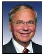
Harry Mitchell - Congressional District 5

“We must focus on creating quality jobs and maintaining domestic production of our nation’s vital needs, while providing quality education to prepare our children to thrive in global economy.”