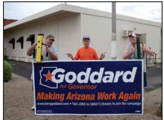
469 PAC volunteers showing off their sign pounding skills.