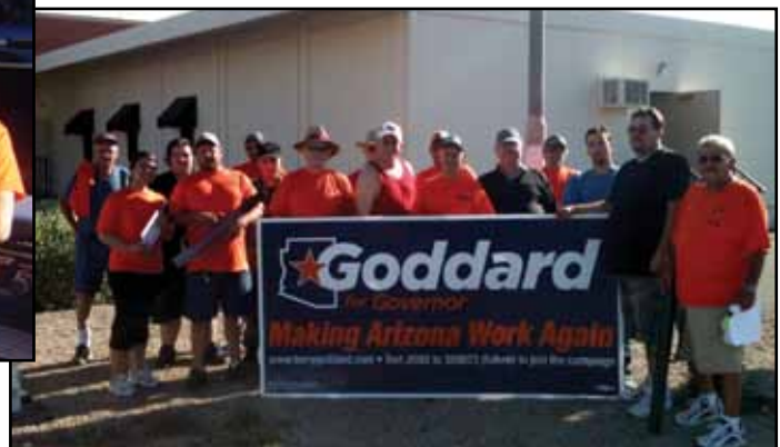
More than 20 volunteers came out for the 1st 469 Political Day of Action and pounded more than 80 campaign signs for 469-endorsed candidates.