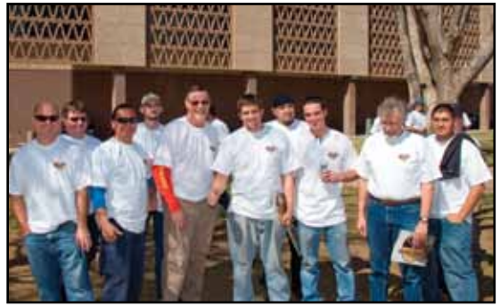
469 apprentices enjoy their time at the Capitol during the Second Lunch on the Lawn.