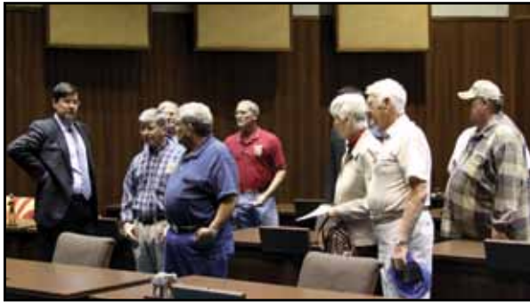
A group of 469 members discuss Arizona politics with Rep. Farley on the floor of the Arizona House of Representatives during the 469 Legislative Capitol Tour.