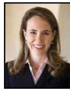
Gabrielle Giffords - Congressional District 8

“The future of America deserves a cleaner, smarter energy agenda that ensures lowered energy costs, reduced global warming and creates hundreds of thousands of green jobs.”