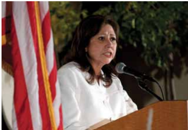
Secretary of Labor Hilda Solis speaks about issues facing labor around the county and in Arizona during the 2011 Heritage Dinner.

The U. S. secretary of labor wields substantial power when it comes to unions, government contracts and labor law. Almost immediately after Hilda Solis was appointed secretary of labor, the Arizona Pipe Trades 469 saw a sharp increase in activity at the Department of Labor. Soon after taking office in February 2009, Solis reallocated DOL funds to increased Davis-Bacon compliance, investigation and enforcement. This action has directly affected the Arizona Pipe Trades 469; the Davis-Bacon Act requires projects that receive government