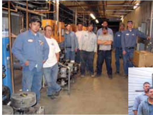
Fry's #19 equipment room