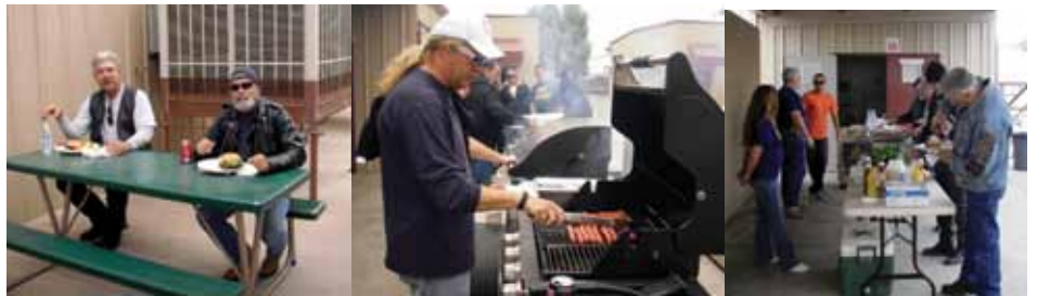
469 members enjoy lunch and a full day of cruising and cards to benefit the Area Agency on Aging.

The Poker Run is comprised of five stops where participants play poker and cruise their motorcycles and classic cars to various locations. Midway through the day, lunch was served at the Pipe Trades Training Center.