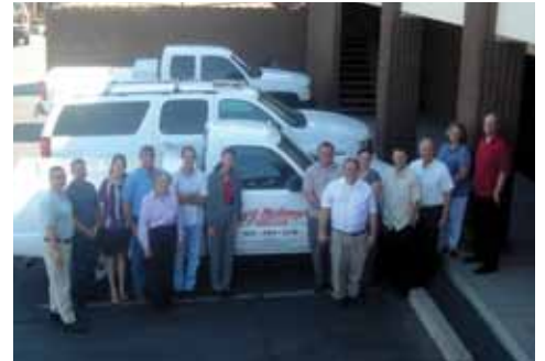
Some of W.J. Maloney’s valued team members

started with when we opened the doors in 1964.”