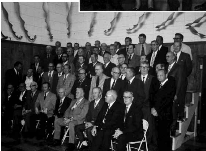
1972 Pin Ceremony Participants