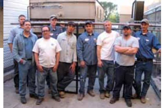
The evaporative condenser refrigeration system