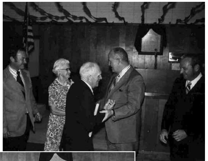
1971 Pin Ceremony Participants enjoying the party